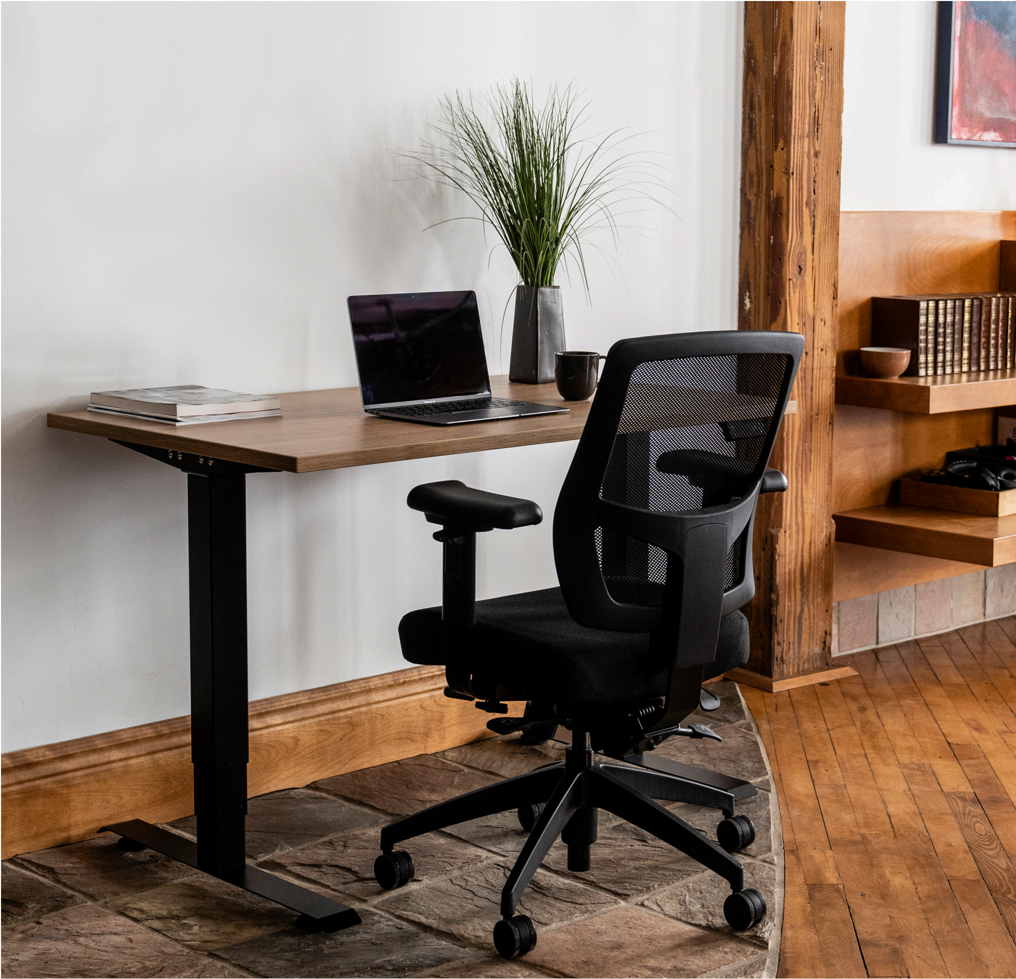
Adjustable table, Ginger Root laminate surface with Black base.

Several studies show the positive impact of varying positions on different health issues such as cholesterol, type 2 diabetes and weight management.