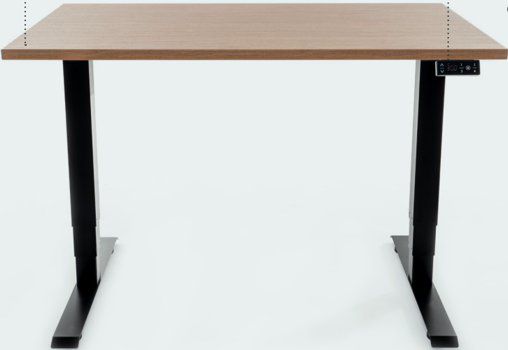
Table surface available in the full range of Artopex laminates, with square or round corners.

Multifunctional keyboard with a numeric display and four personalized customizable heights.